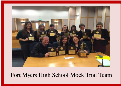
Fort Myers High School Mock Trial Team